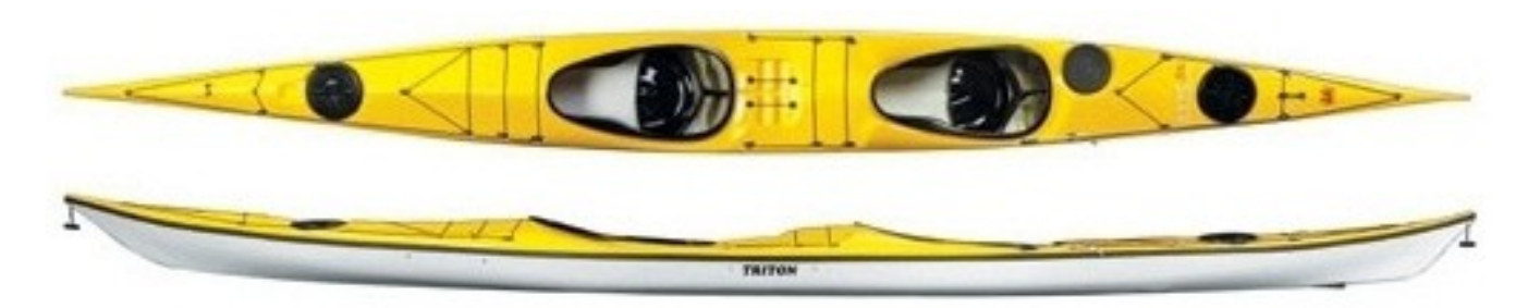
double sea kayak

A "double" sea kayak will provide two cockpit openings. While double sea kayaks can be fast, efficient, and very suitable for sea kayak touring and expeditions, we do not use them for this course. Learning in a single sea kayak will allow you greater control over the kayak, with better feedback to help you improve your strokes. Through learning how to control your own kayak, under your own power, you will come to know your own abilities, bringing you more confidence as a paddler. You will enjoy being the "captain" of our own boat. Most Mountaineer Sea Kayakers, even those who have purchased double sea kayaks, prefer single sea kayaks for almost all club sea kayak outings.