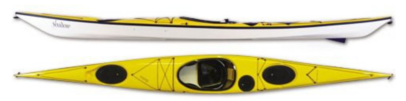
single sea kayak