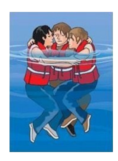
Huddle Retains body heat and increases survival time

If there are several people in the water, huddling close, side to side in a circle, also will help preserve body heat. Placing children in the middle of the circle will lend them some of the adult body heat and extend their survival time.